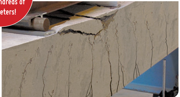
Crack measurements by EpsilonSensor during bending tests