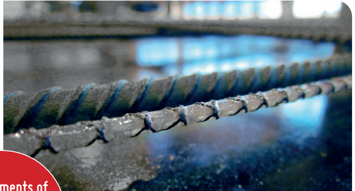
EpsilonSensor embedded into a reinforced concrete slab

Measurements of structural strains up to hundreds of kilometers!