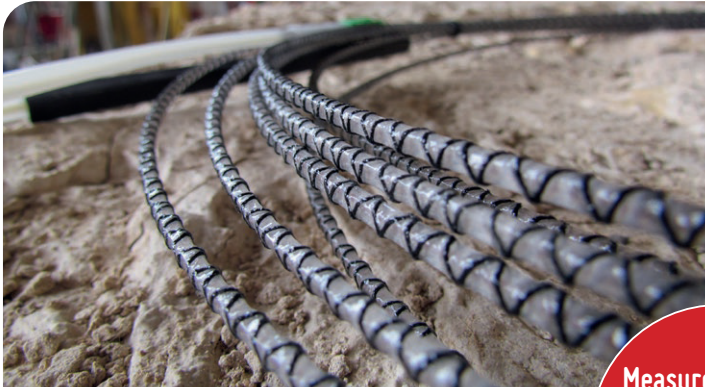
EpsilonSensor before installation in a lab specimen